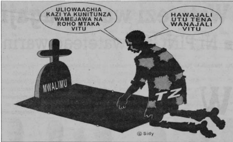
Figure 2. Cartoon from the weekly newspaper Mwana Halisi , May 2012 (see main text for translation). With permission of the publisher.

Many of the mentions of Nyerere are connected to what Tanzanians have come to call ufisadi , ‘high-level corruption’, reiterating his role as a paragon of virtue in public office. 43 The type of concerns that Nyerere is evoked to address are well summarized in a cartoon published in another independent weekly paper, Mwana Halisi (‘The genuine child’) in May 2012. A barefoot, ragged figure representing Tanzania kneels at Nyerere’s grave, saying ‘Those to whom you have left the task of looking after me have been filled with the spirit of wanting things. They no longer care about humanity; they care about objects’ (Figure 2).