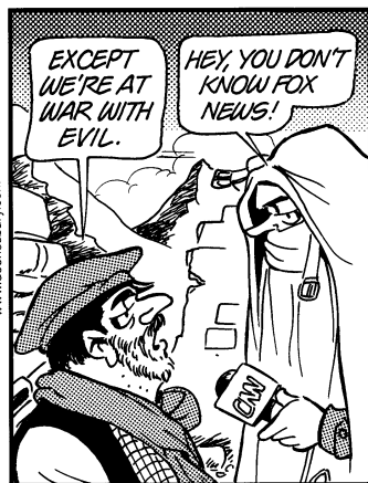
DOONESBURY ©2001 G. B. Trudeau. Reprinted with permission of UNIVERSAL PRESS SYNDICATE. All rights reserved.